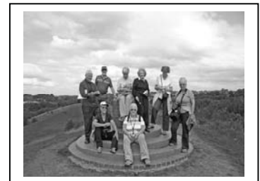
Field day at Baggeridge

The Digital Imaging Group is flourishing, with between 15 and 20 members as regular attenders. We now have a number of members who can offer skills to the group as a whole which has enabled us to expand our activities. This means that a Photoshop workshop can be happening in one part of the room, whilst another group is looking at the absolute basics of getting photos into a computer and out again at the other end.